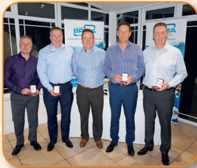
The EMIR team at the Aston Villa Golf Day